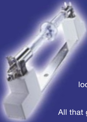
OSRAM SFC10-4 pre-focus socket

You know the powerful OSRAM SharXS® HTI® lamp. Now meet its mate. The OSRAM SFC10-4 pre-focus socket takes performance to new depths. Versatile and easy to use, the socket can be wired from the left or right side, and works with SharXS HTI lamps. A special key-lock feature pre-focuses the lamp for accurate insertion every time.